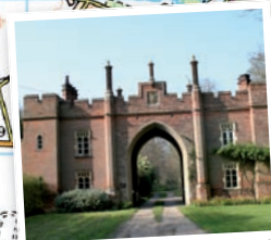
Dog Lodges on Dog Corner at Heydon